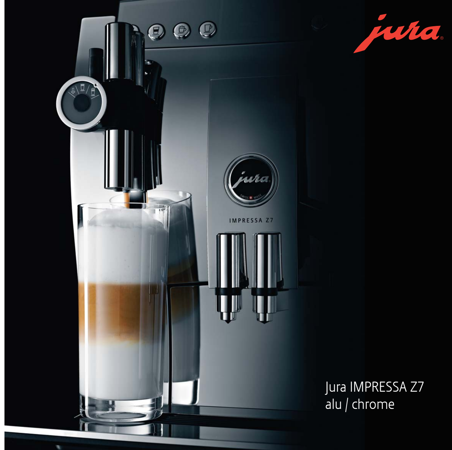
Jura IMPRESSA Z7 alu / chrome